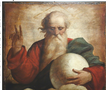
Benediction of God the Father by Luca Cambiaso c.1565

However, the harmony of the created order was shattered when God's creatures rebelled against His will and took to themselves power and authority which was not theirs to take. Tempted by the serpent, Eve believed that she could be the arbiter of what constitutes good and evil and so become her own god (Gen 3:5). She in turn tempted Adam, who held the supernatural gift of justification (that is, sanctifying grace) and the preternatural gift of impassibility (the possibility of not suffering) in trust on behalf of all of Mankind. In trying to take to himself this same power – to decide for himself what constitutes good and evil – Adam effectively turned his back on God and forfeited these two precious gifts, leaving his race stained with that same sin of pride and disobedience, as well as leaving damage done to the unity and harmony of human nature itself.