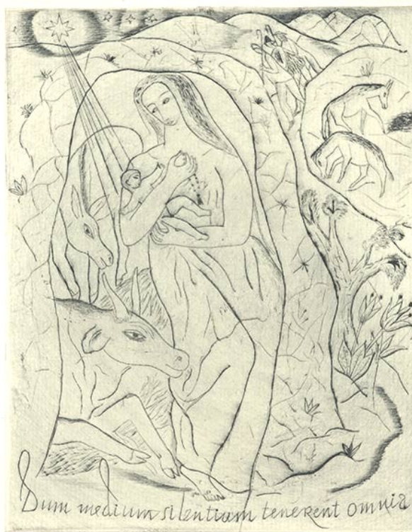
Nativity with Beasts and Shepherds by David Jones (1895-1974)

Dum medium silentium tenerent omnia, et nox in suo cursu medium iter haberet omnipotens sermo tuus, de caelis a regalibus sedibus venit.