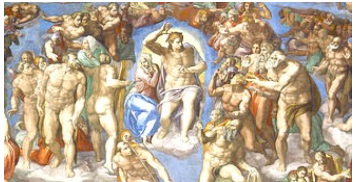
The Last Judgement by Michelangelo.

At the end of time, at the moment of Christ's coming in glory, those who have already died, as well as those still alive on the earth, will be caught up in the final, the General Judgment, which serves four purposes. First, the judgment of God upon the wicked who have thrived in this life will be seen by all, and that judgment will be vindicated (Ps 50[49]:6). Second, our bodies will then be resurrected to share in the virtue and glory, or the guilt and condemnation, of the soul. Third, the trail of good that each of us leaves behind us in this life will be rewarded, and the trail of harm that we have left behind us will be judged and the concomitant mess will be sifted and sorted out by God, and any guilt punished. And, finally, Christ, so ignominiously and ignobly dishonoured, condemned, and crucified, will be vindicated and glorified before all of creation.