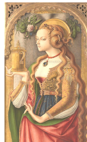
Detail of St Mary Magdalene by Carlo Crivelli (1480)

We know the saints, in part, by their attributes: Apostle, Martyr, Confessor, Virgin, Widow, and so forth. In the Missal, St Mary Magdalene is known simply as Penitent, and is the only saint in this category, a fact recognized by Pope Francis during the Year of Mercy (2015-16) when he raised her feast day to the rank of FEAST (instead of MEMORIAL). Since at least the time of Pope St Gregory the Great (d. 604), perhaps from the time of St. Augustine (d. 430), and possibly even from the time of St Hippolytus (d. 235), Mary Magdalene has been recognized as the penitent sinner who washed the feet of Jesus, as the sister of Mary and Lazarus, and as the first witness to the resurrection. But there is a strong and ancient tradition which says she was also the woman taken in adultery, which would, perhaps, explain the depth of her penitence and gratitude to Our Blessed Lord.