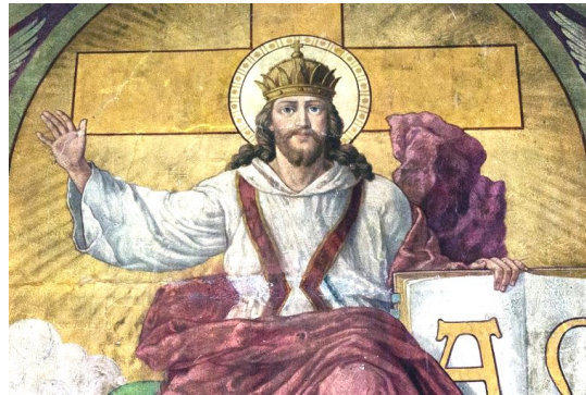
Christ the King, Goesdorf, Luxembourg

As we have seen, God dwells in an eternal present with no past and no future. Following the second coming of Our Lord at the end of the world as we know it, there will be no more time because time itself is part of the created order which will have been consummated in the new creation. Eternity for us will not consist of a future which stretches out infinitely beyond the horizon, nor will it involve a series of repetitions, or even a stasis, extending further than the eye can see or the mind imagine, threatening an overwhelming monotony. Rather, we will participate in God's eternal present, and join with Him in a life of perfect blessedness which, in its richness and its satisfying of mind, body, and soul, will exceed our wildest imaginings.