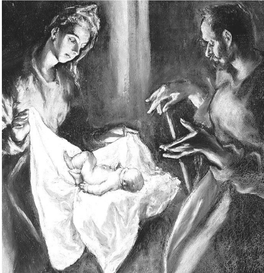
The Nativity by El Greco (1541-1614)