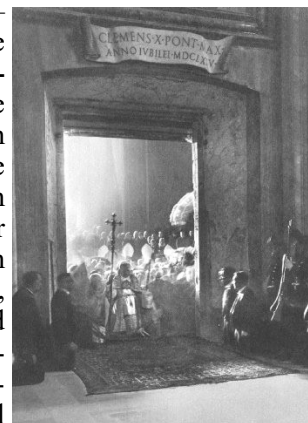
Pictured: Pope Pius XI opening the Holy Year Door one hundred years ago in 1925 (above) and the Holy Year Door today (top).

In particular, there will be—as there has been since the year 1300—a Holy Year Indulgence which may be gained by fulfilling certain conditions. Details of these conditions will be laid out in our forthcoming Holy Year Handbook which will explain what these conditions are, what an indulgence is, and how you may gain the indulgence. Copies of the handbook will be free but we shall ask for donations to cover the costs please.